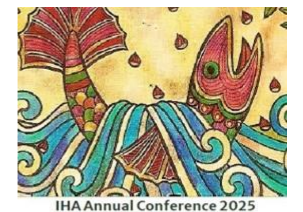
Call for proposals to host

An annual call to member institutions is made to run a conference, under the auspices and with the financial support of the IHA. Successful applicants nominate individuals to join an IHA Steering Committee to take responsibility for