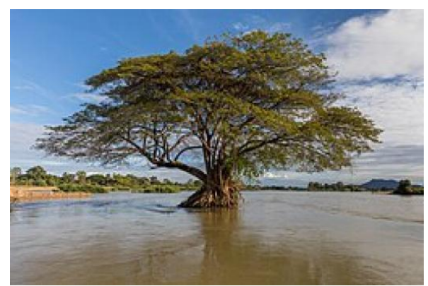
Flooded rain tree in the Mekong.