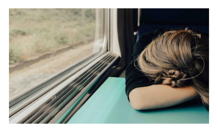
Sleeping woman